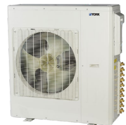
208/230V 18K-42K BTU/h INVERTER-DRIVEN HEAT PUMP SYSTEMS